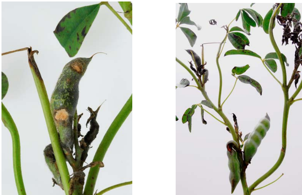
Fig 1. Attack of anthracnose in lupin. Left is shown pods with symptoms and necrosis on young tissue. To the right is shown destruction of upper branches.

production of infected seeds during winter 2006-2007. In 2007 the first field trial with variable infection level was carried out. Seeds with 0%, 2,5%, 5% and 7,5% anthracnose infection of the resistant Lav8-5, the susceptible Prima and the highly susceptible Eranti were evaluated in a 4 replicate block experiment. Due to the dry and warm spring the initial transmittance from seed to plant did not occur and anthracnose symptoms were not observed later in the season. The plots were harvested in September 2007 and seeds are being prepared for analysis for infection of Coletotrichum lupini .